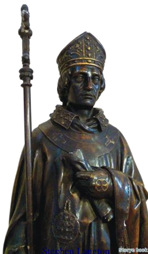
Stephen Langton Archbishop of Canterbury 1207-1228

As Mordecai wisely said to Queen Esther “and who knoweth whether thou art come to the kingdom for such a time as this?” Esther 4:14.