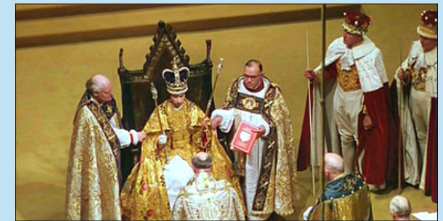
The Queen Enthroned with "The Royal Law"