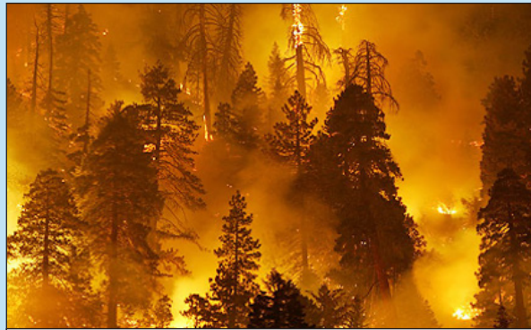
The Fire of Jeremiah Royal Law – James 2v8 www.timefortruth.co.uk/why-av-only/

Britain must therefore regain her only fire-break "the royal law" the AV1611 to receive mercy when God's End Times judgement by fire descends "that the whole nation perish not" John 11:50.