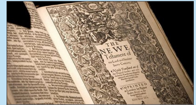
"The Royal Law" James 2:8