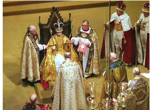
The Queen Enthroned with “The Royal Law”