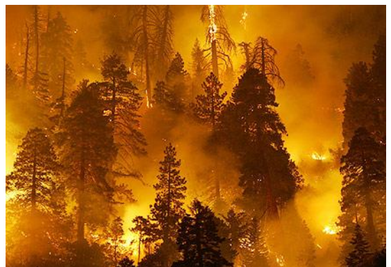
The Fire of Jeremiah

God promises a judgement by fire in the End Times. “And I will send a fire on Magog, and among them that dwell carelessly in the isles: and they shall know that I am the LORD ” Ezekiel 39:6.