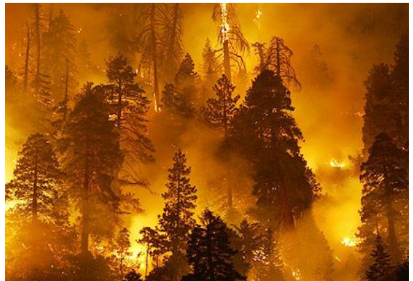
The Fire of Jeremiah

God promises a judgement by fire in the End Times. “And I will send a fire on Magog, and among them that dwell carelessly in the isles: and they shall know that I am the LORD” Ezekiel 39:6.