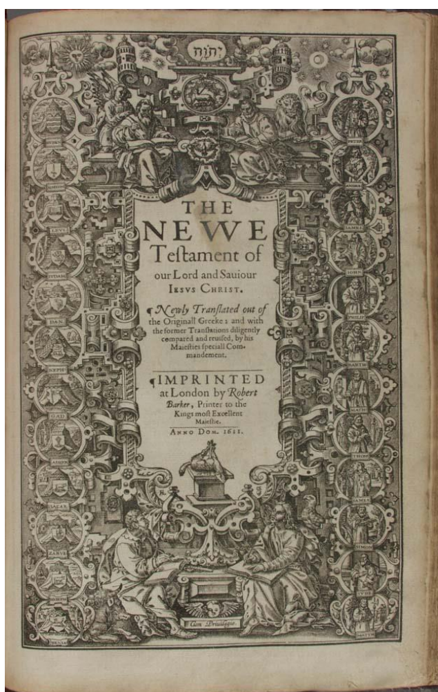
The 1611 King James Bible - Title Page (Newe Testament)

Finally with respect to the authority indeed supremacy of the King James Bible, consider the wisdom of the men who perfected “the royal law...the whole law” James 2:8-10.