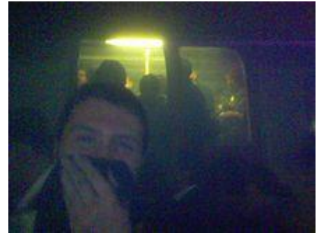
Passengers trapped in a carriage aboard a bombed train en.wikipedia.org/wiki/7_July_2005_London_bombings

We now have another serious practical lesson for the child of God.