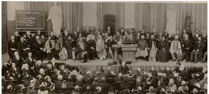
Parliament of the World’s Religions Chicago Meeting 1893