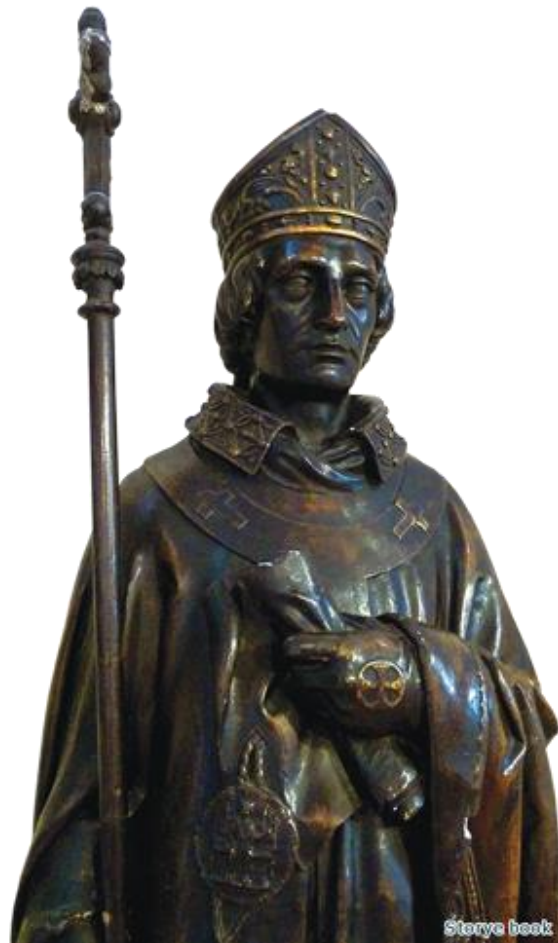
Stephen Langton Archbishop of Canterbury 1207-1228

Chapter-division was apparently the right idea at the right time, and one of the remarkable things about the Langtonian chapter divisions is how they were adopted and propagated by different scholarly communities. Jewish scholars (who had worked with other methods of division previously) soon began observing Langtonian chapter divisions, and the churches of the Christian East took the same divisions over in their biblical studies...