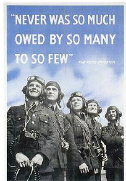
World War II poster containing the famous lines by Winston Churchill

Concerning those "...even in Sardis which have not defiled their garments; and they shall walk with me in white: for they are worthy" the statement contrasts Titus 1:16 "They profess that they know God; but in works they deny him, being abominable, and disobedient, and unto every good work reprobate" with Revelation 19:7-8 "Let us be glad and rejoice, and give honour to him: for the marriage of the Lamb is come, and his wife hath made herself ready. And to her was granted that she should be arrayed in fine linen, clean and white: for the fine linen is the righteousness of saints" according to Ephesians 2:10 "For we are his workmanship, created in Christ Jesus unto good works, which God hath before ordained that we should walk in them."