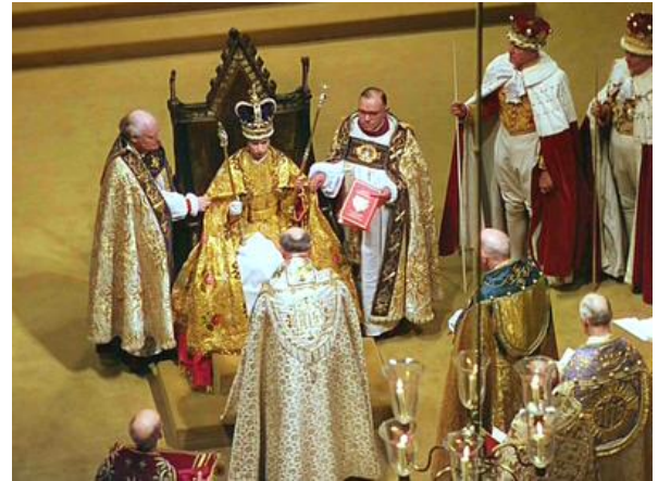
The Queen Enthroned with “The Royal Law”