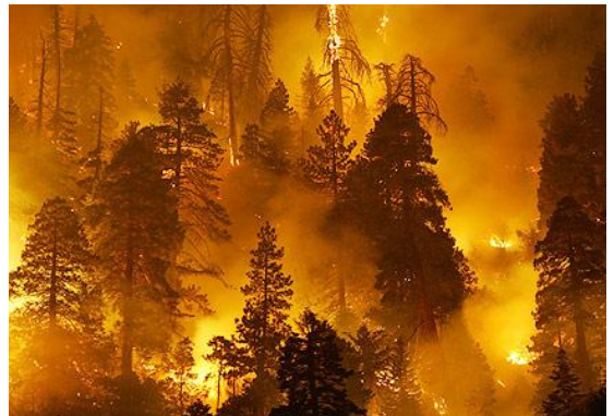
The Fire of Jeremiah

God promises a judgement by fire in the End Times. “And I will send a fire on Magog, and among them that dwell carelessly in the isles: and they shall know that I am the LORD ” Ezekiel 39:6.