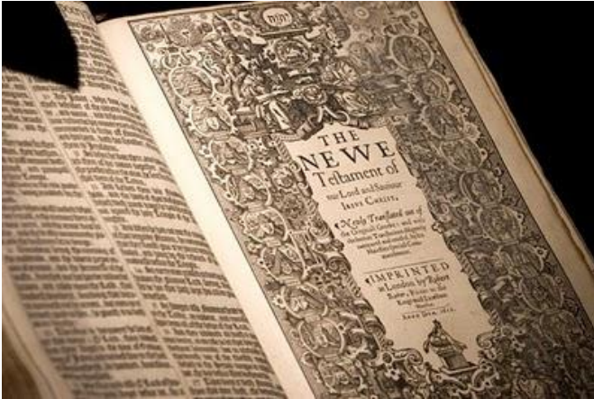
“The Royal Law” James 2:8