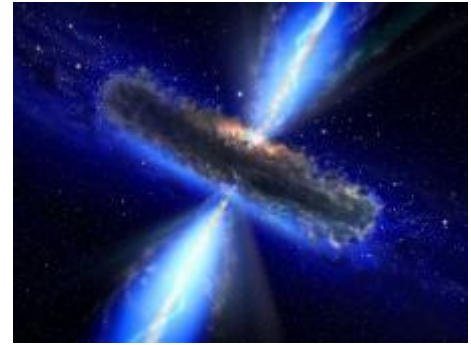
Artist’s Concept of a Qasar or Feeding Black Hole

Two teams of astronomers have discovered the largest and farthest reservoir of water ever detected in the universe. The water, equivalent to 140 trillion times all the water in the world’s ocean, surrounds a huge, feeding black hole, called a quasar, more than 12 billion light-years away.