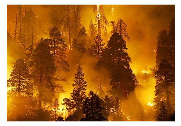
The Fire of Jeremiah

God promises a judgement by fire in the End Times. "And <u>I will send a fire</u> on Magog, <u>and among them that dwell carelessly in the isles:</u> <u>and they shall know that I am the LORD</u>" Ezekiel 39:6.