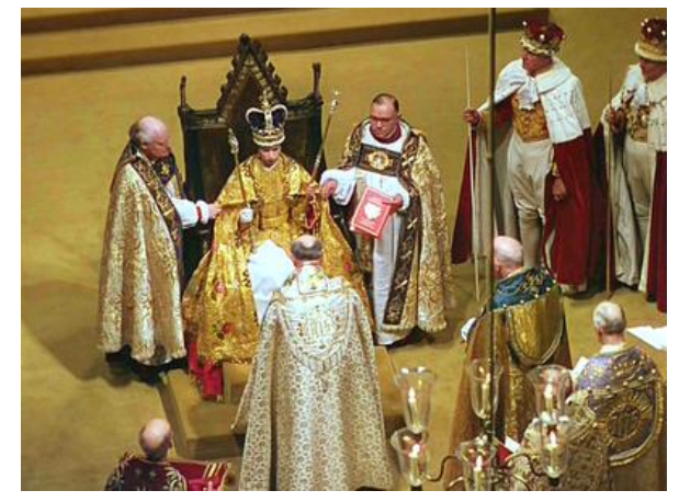
"The Royal Law" James 2:8