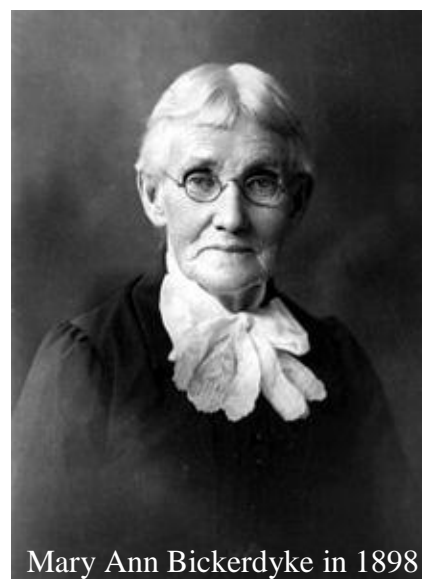
Mary Ann Bickerdyke in 1898