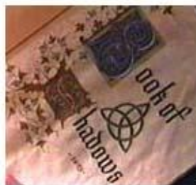
from the "Charmed" TV series

One of the most occultic television shows ever aired is "Charmed". "Charmed" details the spells and occultic practices of three witches. The "NKJV symbol" is the show's primary symbol of witchcraft and is splattered throughout the series. Notice the "NKJV symbol" displayed on "The Book of Shadows." The Book of Shadows is commonly used in witchcraft and satanism: