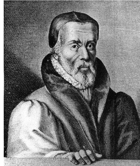
William Tyndale 1494-1536 en.wikipedia.org/wiki/William_Tyndale

In 1535, Tyndale was arrested and jailed in the castle of Vilvoorde (Filford) outside Brussels for over a year. In 1536 he was convicted of heresy and executed by strangulation, after which his body was burnt at the stake. His dying request that the King of England’s eyes would be opened seemed to find its fulfilment just two years later with Henry’s authorization of The Great Bible for the Church of England — which was largely Tyndale’s own work. Hence, the Tyndale Bible , as it was known, continued to play a key role in spreading Reformation ideas across the English-speaking world and eventually, on the global British Empire . His version also worked prominently into the Geneva Bible which was taken to the New World to Jamestown in 1607, and on the Mayflower in 1620. Notably, in 1611, the 54 independent scholars who created the King James Version , drew significantly from Tyndale, as well as translations that descended from his. One estimate suggests the New Testament in the King James Version is 83% Tyndale’s, and the Old Testament 76%.