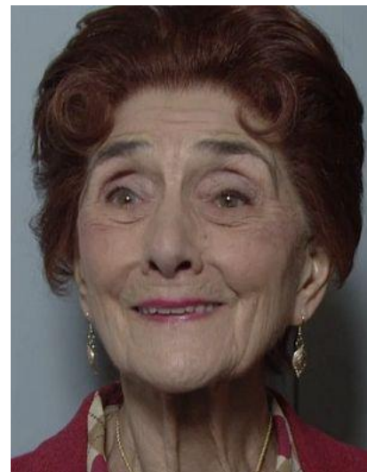
June Brown as Dot Cotton (2013)

“ Behold, the days come, saith the Lord GOD, that I will send a famine in the land, not a famine of bread, nor a thirst for water, but of hearing the words of the LORD: ”