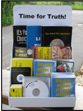
£8 Tract stand ONE

Do you have tract stands full of tracts in your church or 'business?' If not here is a great suggestion (see photos!) The COST of the stands (does NOT include postage) is in RED this obviously does NOT include the tracts. See ORDER FORM for tract prices! You can put your own name/church on the header card for tract stand ONE!