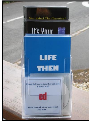
£11 Tract stand TWO