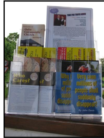
£26 Tract stand THREE