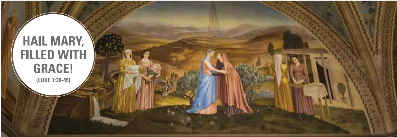
Fresco at the Sanctuary of the Visitation in Ein Kerem, Israel, depicting Mary's meeting with Elizabeth

The first two chapters of the Gospel of Luke are a highly artistically constructed series of five scenes (this excludes the later one of the finding of the child Jesus in the Temple) and the central event is the meeting of Mary and Elizabeth, both pregnant, with Jesus and John the Baptist respectively.