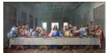
The Last Supper by Leonardo da Vinci in the Convent of Santa Maria delle Grazie

When Luke talks about "disciples", he does not mean simply "the twelve apostles". When we listen to the Gospel, we might keep this wider meaning in mind – and include ourselves among the disciples. ■