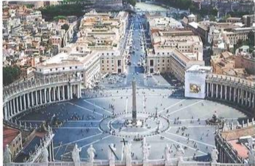
St. Peter's Square from Rome in Vatican State