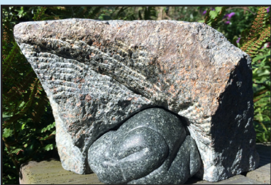
Artist and Sculptor 'Shelter' (2016) Cornish Polyphant Stone. Inspired by Psalm 91 'He will cover you with His feathers and under His wings you will find refuge.'

Authoritative certainly, instructing His disciples to fetch a donkey and colt from a nearby village with details that were 'exactly