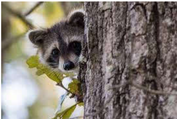
Not our Racoon!

A bit of excitement on Cloudside when a racoon was discovered in the Pollard's hay shed. Some confusion at first wondering whether it was a racoon, however the RSPCA was not interested, and the Animal Rescue people in Congleton came up and fetched it. Apparently, it had a chip but when contacted the people denied all knowledge of it. It looked very happy in its new surroundings but clearly wanted freedom as it managed to undo the catch on his cage and escaped! Perhaps looking for another hay shed to hide up in over the winter.