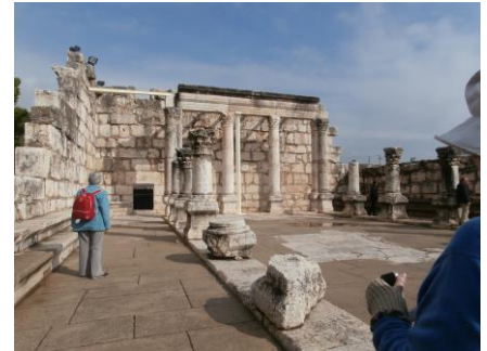
The Synagogue at Capernaum today