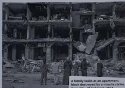
A family looks at an apartment block destroyed by a missile strike. Gaza City, 21 February 2024.