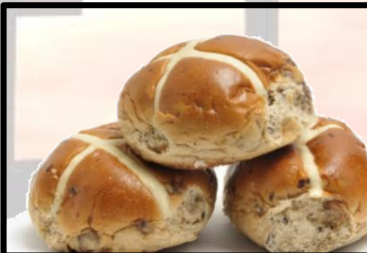
A hot cross bun is a sweet, spiced bun. It is made with dough and raisins and has a cross on top. The cross represents the crucifixion of Jesus and the spices signify the spices used on his body.