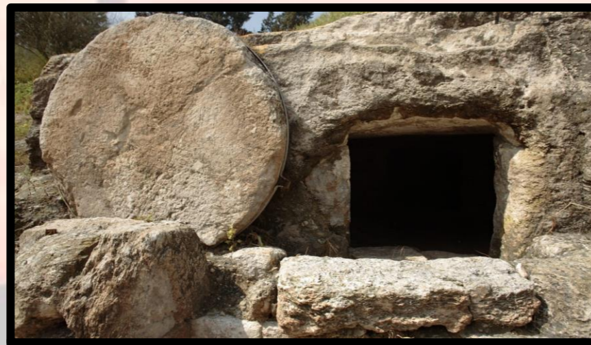
This is what Jesus' tomb may have looked like. Can you see the big stone that was rolled across?

On Palm Sunday, believers will arrive at Sunday mass and receive a palm leaf cross. The Palm crosses symbolise the palms that were waved when Jesus entered Jerusalem.