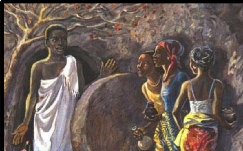
'Resurrection Sunday', by the Jesus Mafa Project - Africa