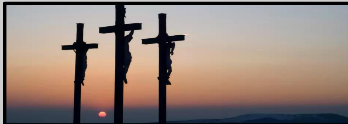
Soldiers nailed Jesus to the cross, and crucified Him along with two criminals.