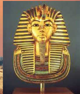
Tutankhamun's death mask

Howard Carter was a British archaeologist who discovered the tomb of Tutankhamun in 1922. It is thought that Tutankhamun wasn't an especially important king, however, the discovery let archaeologists record what an Egyptian King's tomb looked like and learn more about ancient Egypt.