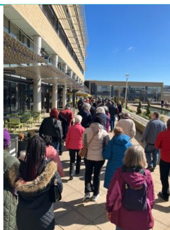
The Walk with the Cross