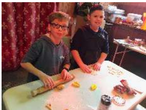
The Sunday Club at St Mark's making cookies on Epiphany Sunday