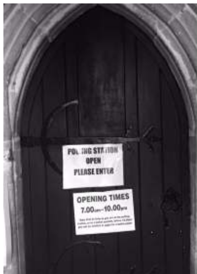
A first for St Mark's Church when it doubled as the polling station for voters in Englefield at the General Election on 12 th December.