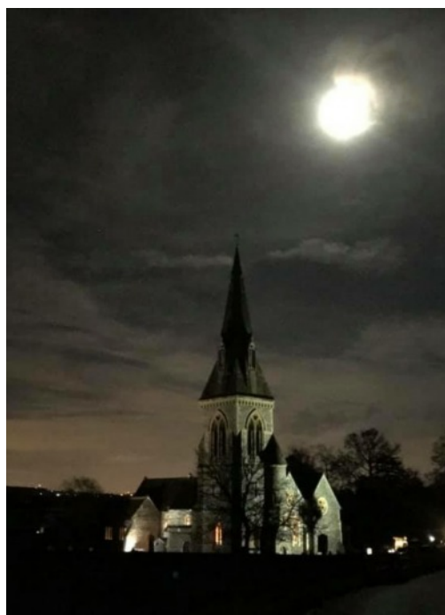
A stunning photograph of St Mark’s in the moonlight taken on the evening of the Englefield School carol service in December.

The words of the prophet Isaiah were uttered centuries before Jesus was born. Down through the years, God had spoken to his people through the prophets, who together painted a vivid picture of what God’s Messiah would be like when he finally appeared on the scene of world history. The fact is that every one of these prophecies is fulfilled in Jesus. In his book, The New Evidence That Demands a Verdict , Josh McDowell says: ‘The Old Testament contains over three hundred references to the Messiah that were fulfilled in Jesus’. Many of these prophecies, such as the circumstances surrounding his birth and his death, would have been totally outside Jesus’ control were he only a man trying to act in line with what Scripture had foretold. The fact that Jesus fulfilled all these ancient announcements strengthens our confidence that he is who he claims – God’s Messiah, come to redeem his people and set them free. How else can we explain this staggering coincidence?