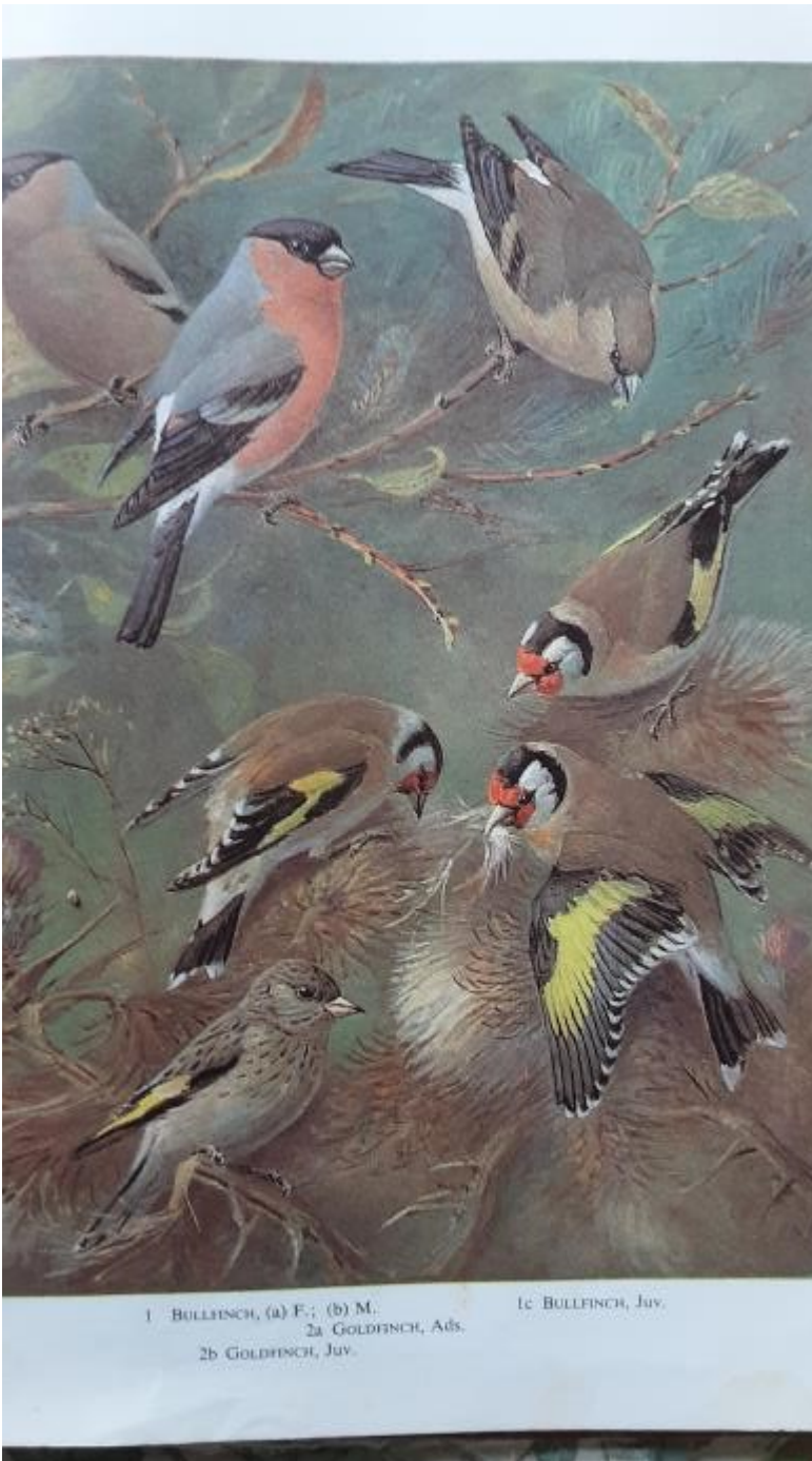
1 BULLFINCH, (a) F.; (b) M. 2a GOLDFINCH, AdS. 2b GOLDFINCH, Juv.