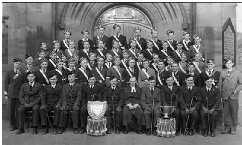
216th Company of the Boys' Brigade