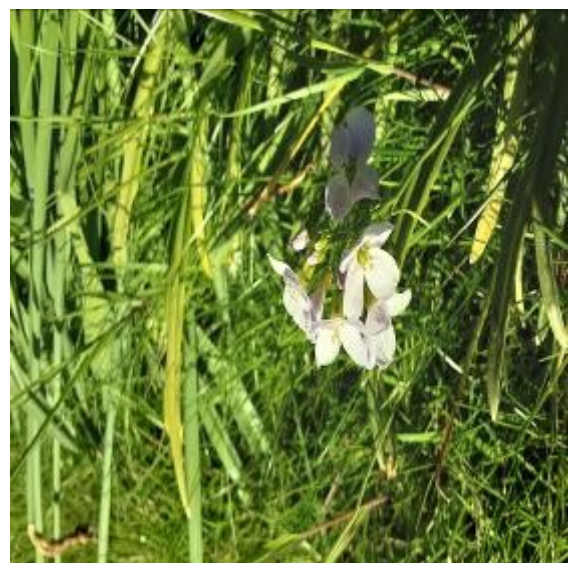
No Mow May in Oakington