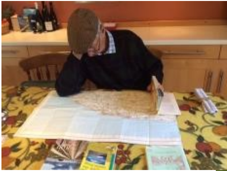
Left—planning for the day with PPLB—Personal Protection for Low Beams