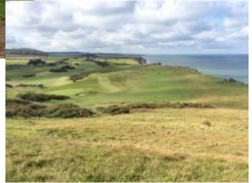
Right—Sheringham Golf Course