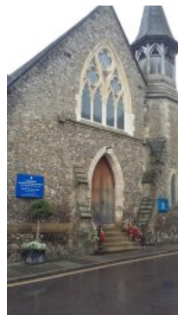
Below—The Candle House Petworth

Petworth URC where they have a 30 minute service each Sunday