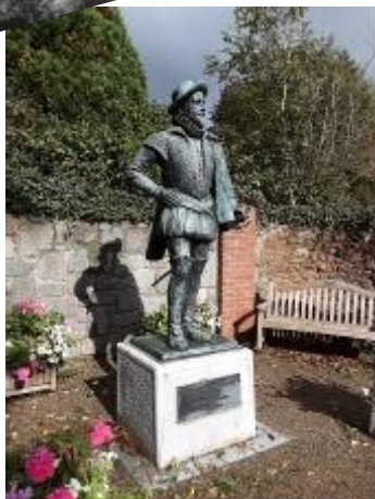
Sir Walter Raleigh was born nearby