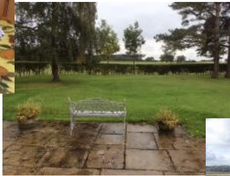
Left -Waiting for sunshine....