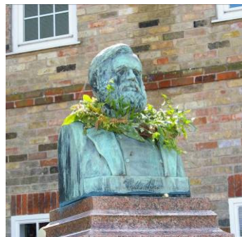
Potto Brown Memorial at Houghton