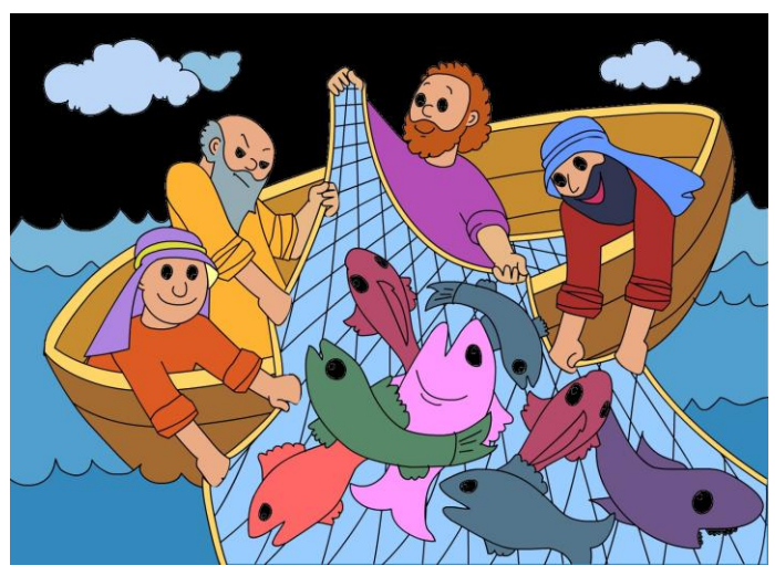
Let's go fishing

CHILDREN'S ACTIVITY MORNING Thursday 30<sup>th</sup> August 9.45 to 12.45 Fun activities for children 4 -10 years with parent or carer