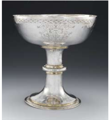
Greyfriars Communion Cup