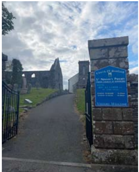
St Ninian's Priory