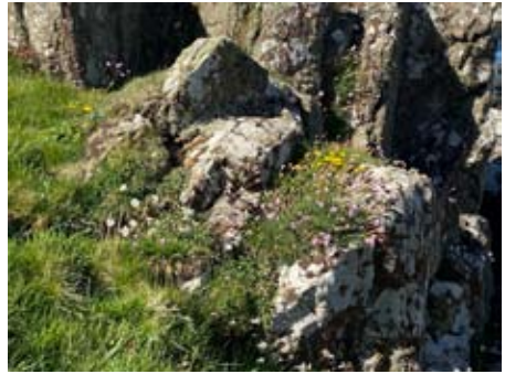
Coastal wild flowers