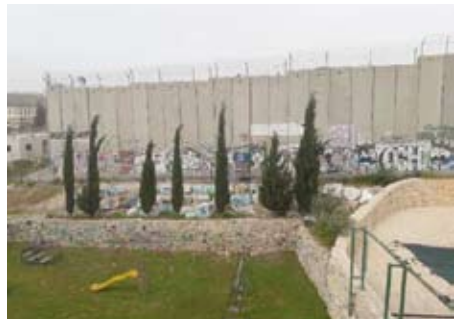
Separation wall in Israel/Palestine