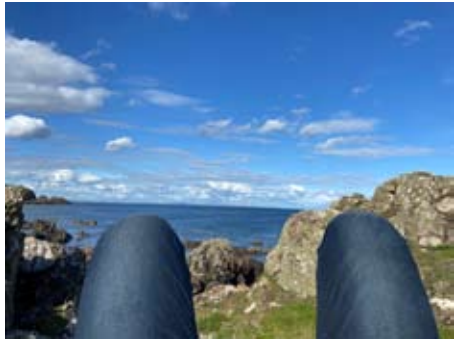
Seascape with ministerial knees