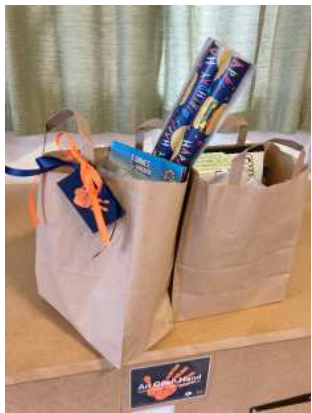
Here is the first gift parcel