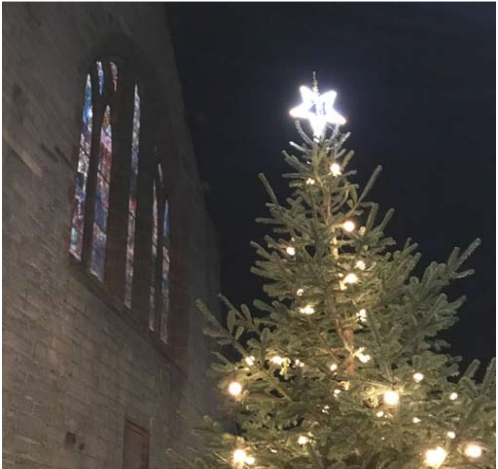
Christmas at Greenbank