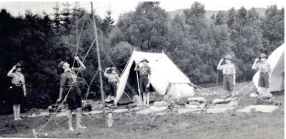
An early camp