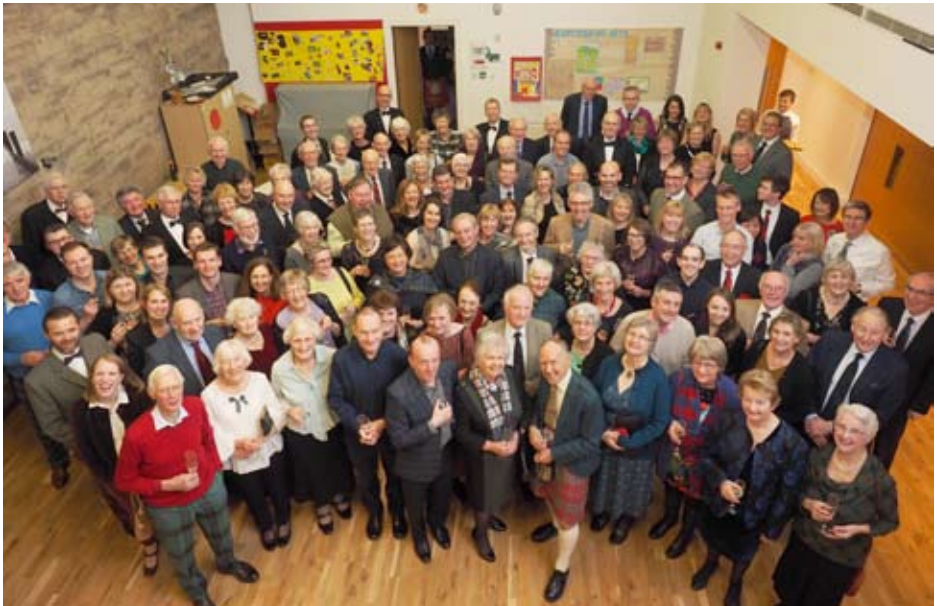
Drinks reception before the YACHT Burns Supper (see article opposite)

Hardware; Pictures and Mirrors; Records, DVDs and CDs; Soft furnishings; and any other saleable items. All offers of help collecting or displaying items and on the day will be gratefully received – please see the form in the vestibule.