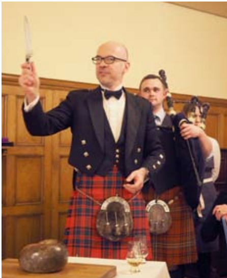
The Minister addresses the haggis

At the time of writing we are looking forward to the Brides and Bubbles Afternoon Tea Event with its fashion show of 100 years