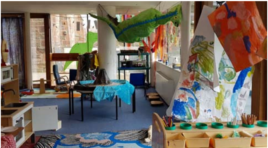
Part of the Centenary Hall, the Pre School home