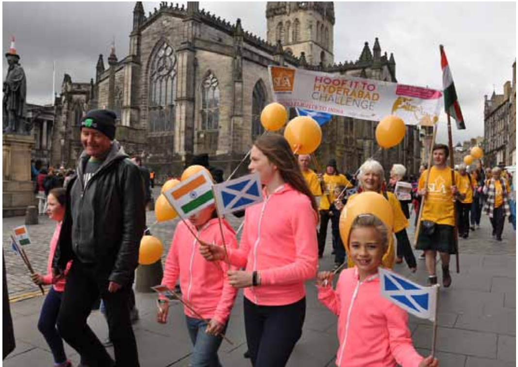
Trainspotting author, Irvine Welsh, launches SLA's Hoof it to Hyderabad Challenge (see page 12)