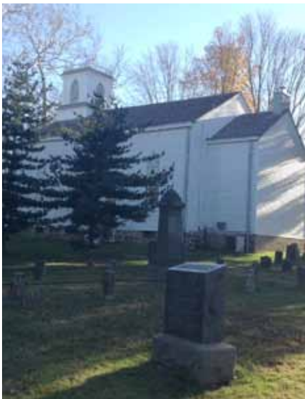
The Church at New Vernon