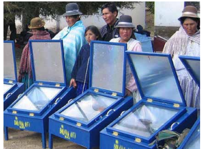
Caring for Mother Earth in Bolivia will work with over 700 families, supporting them to build and use solar powered ovens