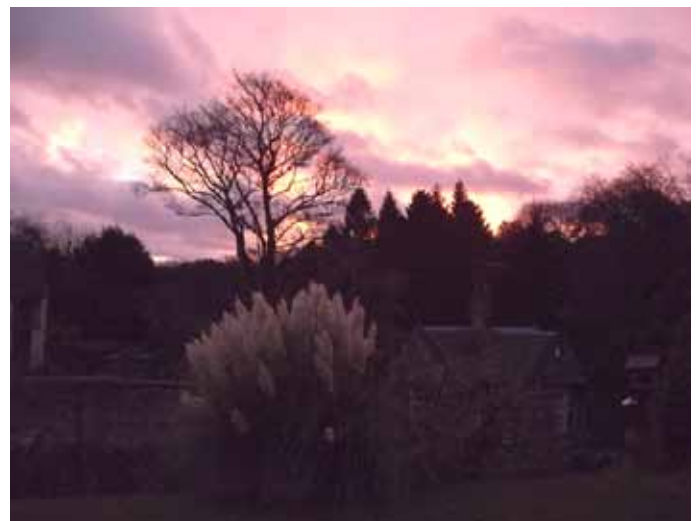
The Hermitage at sunrise

A small number of charities, including CrossReach (Church of Scotland Social Care Council), will be selling Christmas cards after both services on Sunday 2nd November .