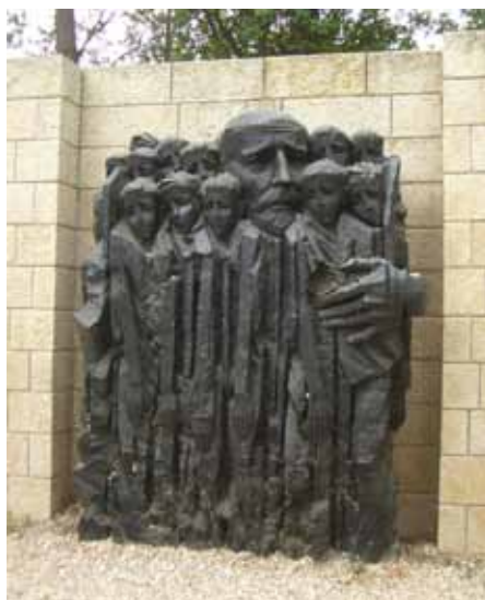
Vad Yashem (Holocaust Museum), Jerusalem