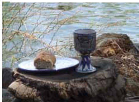
Communion by the Sea of Galilee