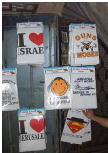
Market in Jerusalem