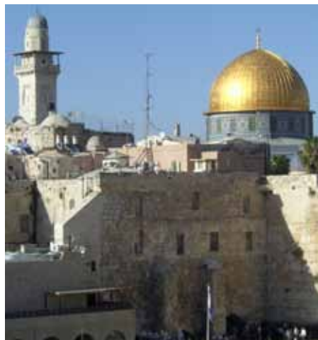
Temple of the Mount, Jerusalem