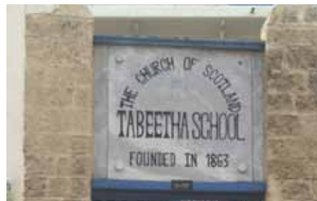
Entrance to Tabeetha School, Jaffa