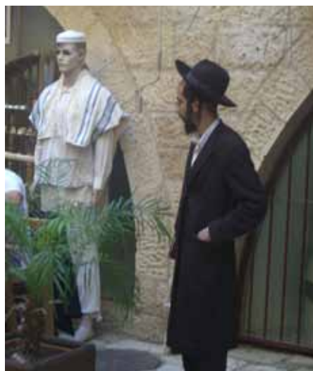
Street in Old Jerusalem