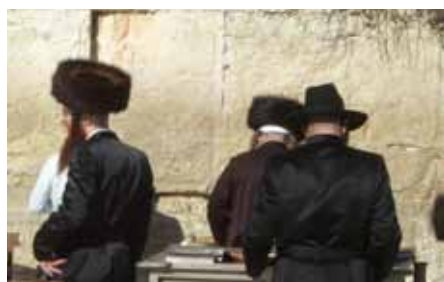
Western (Wailing) Wall, Jerusalem