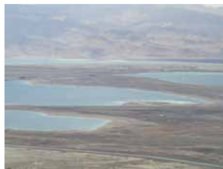
The Dead Sea (from Masada)