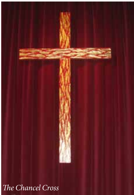
The Chancel Cross

We hope you liked the picture of the Revelation window in the April Leaflet, and