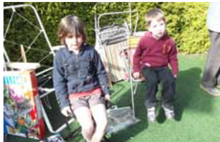
Trying the chairs for size

we have seen the demise of TVs, monitors, videos, records, home brew kits, china services and an increase in lamp shades, CDs/DVDs, pictures and suitcases. We now even have a Christmas decorations