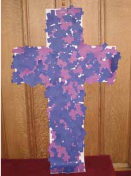
The Children's Easter Cross

We hope you liked the picture of the Revelation window in the April Leaflet, and