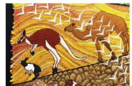
Goodbye to Eden