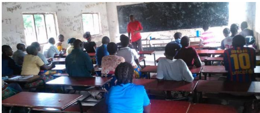
Family Peer Educator training in Nsanje