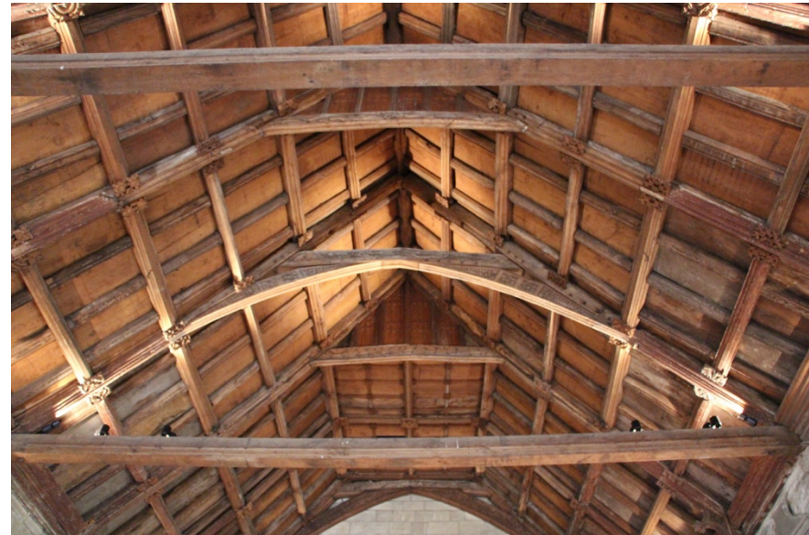
The oldest part of the nave is Norman (about 1150). The pews date from 1933. The nave roof dates from the 15 th century and is made of oak.