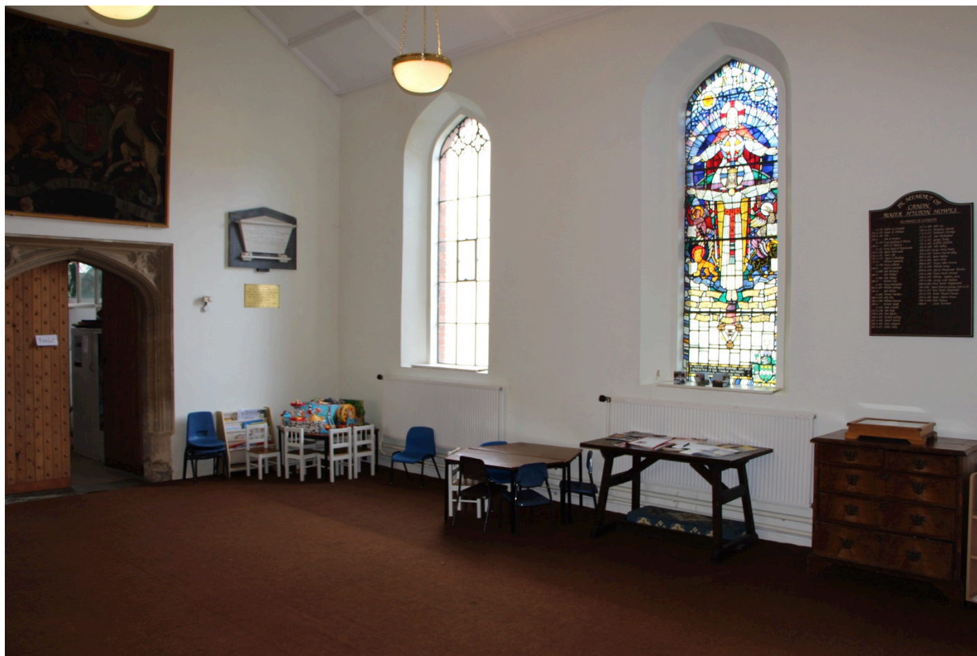
A north aisle was added in 1831 – it's a very useful space which is used for many church activities.