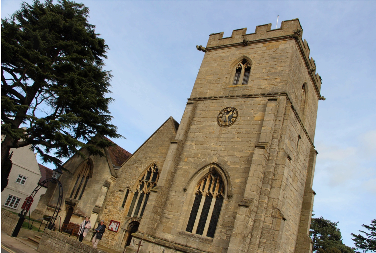
Holy Trinity, Eckington is over 800 years old.

Holy Trinity Church is more than 800 years old. The tower houses the bell chamber; the first bells were installed in 1552.