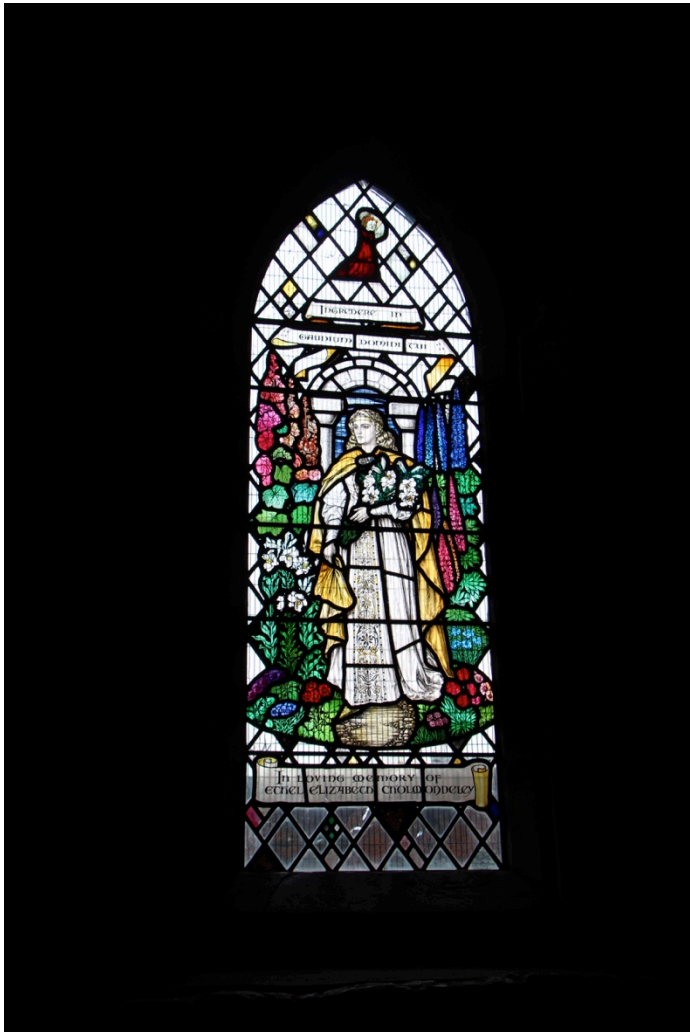
The St Cecilia window at Holy Trinity, Eckington contains fragments of medieval glass and was designed by Florence Camm.